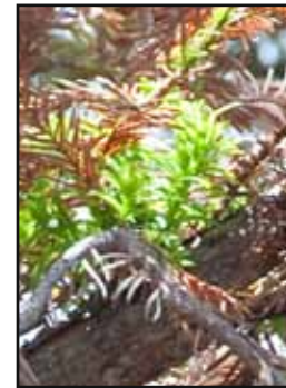
New green growth is clearly visible among the brown needles

The Board now unanimously believes that an official arborists report should be acquired and used to determine whether or not to remove the trees. We have a general estimate from HortScience, Inc, Pleasanton, CA for preparing an official report on the condition of the two trees.