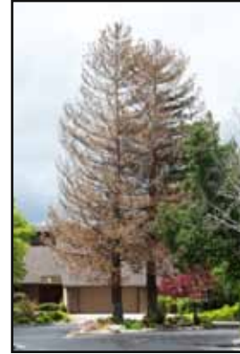
Note the brown color of the tree needles compared to the green leaves on the adjacent trees.

The redwood trees on the island at the corner of Old Tower Rd and McGlinchey Road are showing severe signs of dying (brown needles). The sprinkler duration for these trees has been significantly increased and new green growth is coming out so the trees may recover.